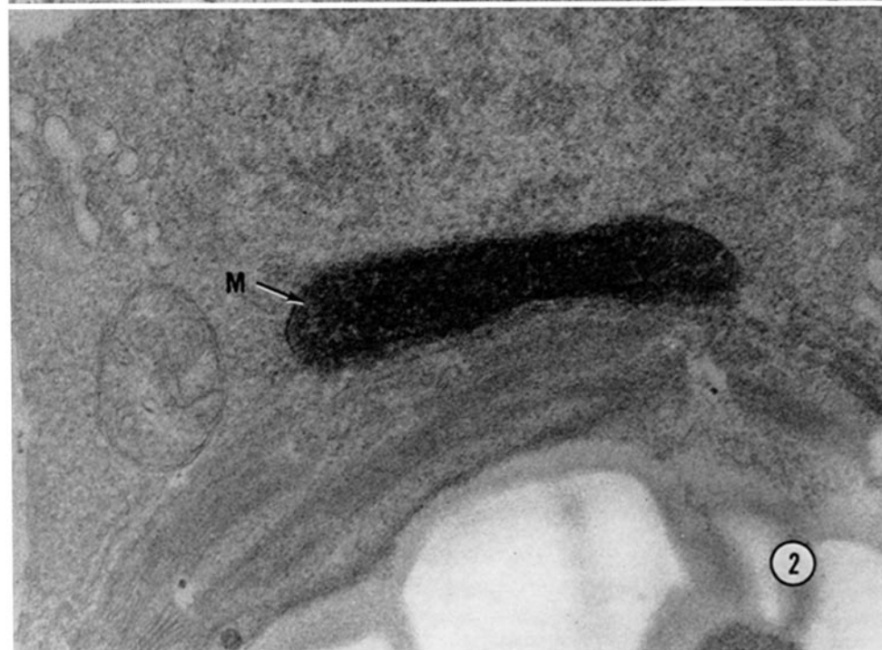
FIGURE 1 The single microbody ( M ) in the usual position between the chloroplast ( C ) and the nucleus ( N ). Cross-section of cell. Glutaraldehyde- \text{OsO}_4 , poststained with uranyl acetate and lead citrate. \times 36,400 .