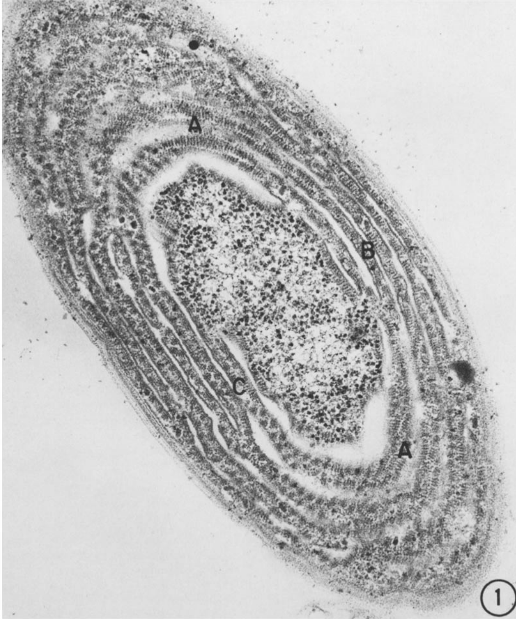
FIGURE 1 This slightly oblique section of the thermophilic blue-green alga Synechococcus lividus displays various planes of section of the concentrically arranged photosynthetic lamellae and of the phycobilisomes attached to them. In grazing sections (A), the phycobilisomes appear as short dense lines. They have a similar appearance in longitudinal section (B), except that their attachment to the lamellae is visible. In cross-section (C), they have a broad rounded face. \times 60,000 .

side of each photosynthetic lamella. The distance from the center of one row of phycobilisomes to that of the adjacent row is 400–500 Å. The shape of the phycobilisomes depends on the plane of section from which they are viewed. Three planes