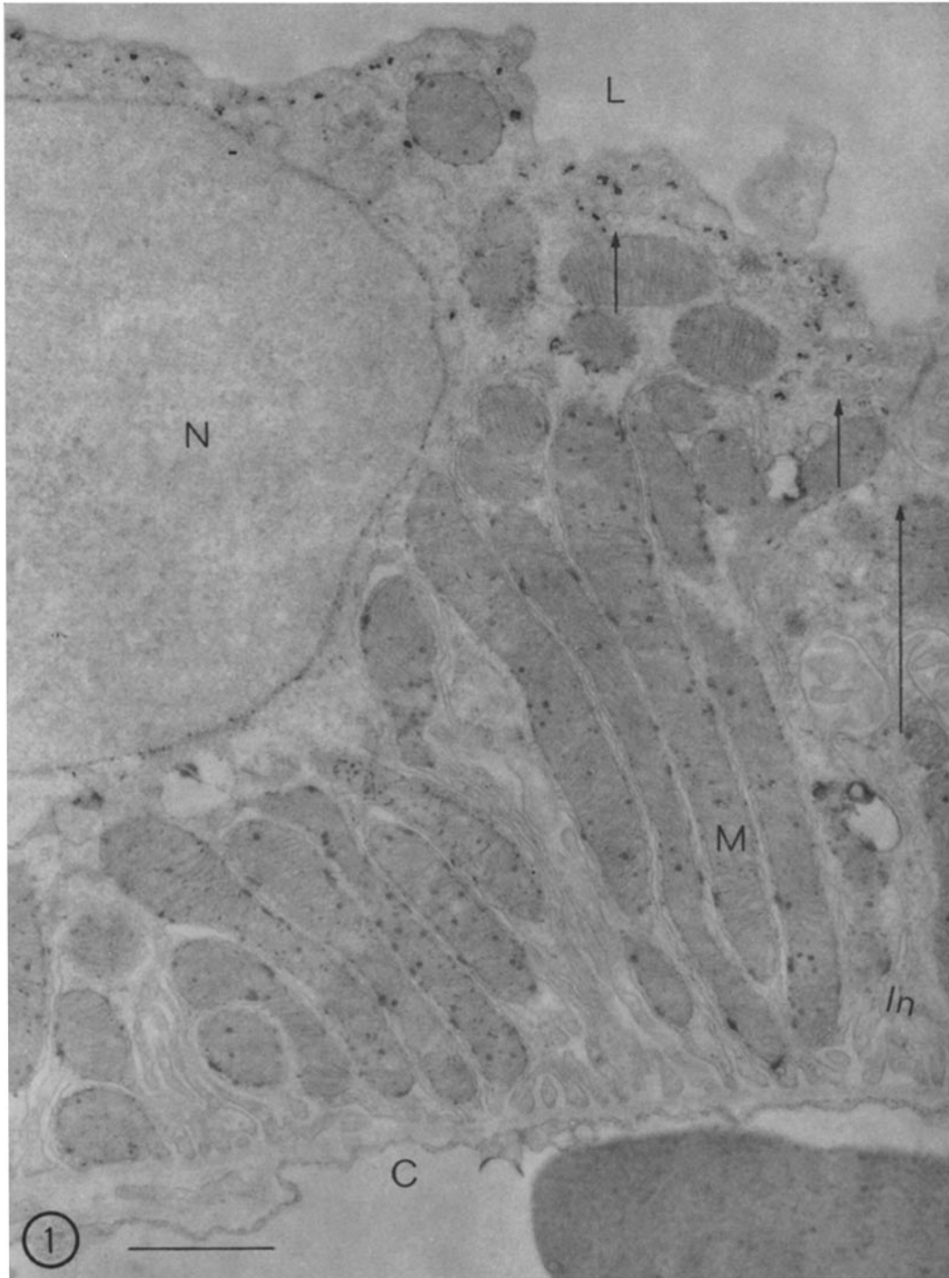
FIGURE 1 Electron micrograph of part of an epithelial cell lining the thick ascending limb of Henle's loop. The tissue block was fixed in glutaraldehyde and formaldehyde, incubated in a GOT histochemical medium, postfixed in \text{OsO}_4 , and embedded in Epon. The thin section was examined without contrast staining. The most concentrated GOT activity appears to be in the subapical vesicles. The electron-opaque enzymatic reaction product is deposited as well circumscribed aggregates which are separated from the vesicle surface by a rather clear zone. There is a small quantity of reaction product deposited in the nuclear envelope and in the mitochondria. About half the number of the vesicles in this part of the cell do not show enzyme activity, but may contain one to three collections of faintly electron-opaque material in the center (short arrows). Lumen of the renal tubule ( L ); nucleus ( N ); mitochondria ( M ); multi-vesicular body (long arrow); basal cytoplasmic membrane infoldings ( In ); and capillary ( C ). Marker, 1 \mu . \times 21,000 .