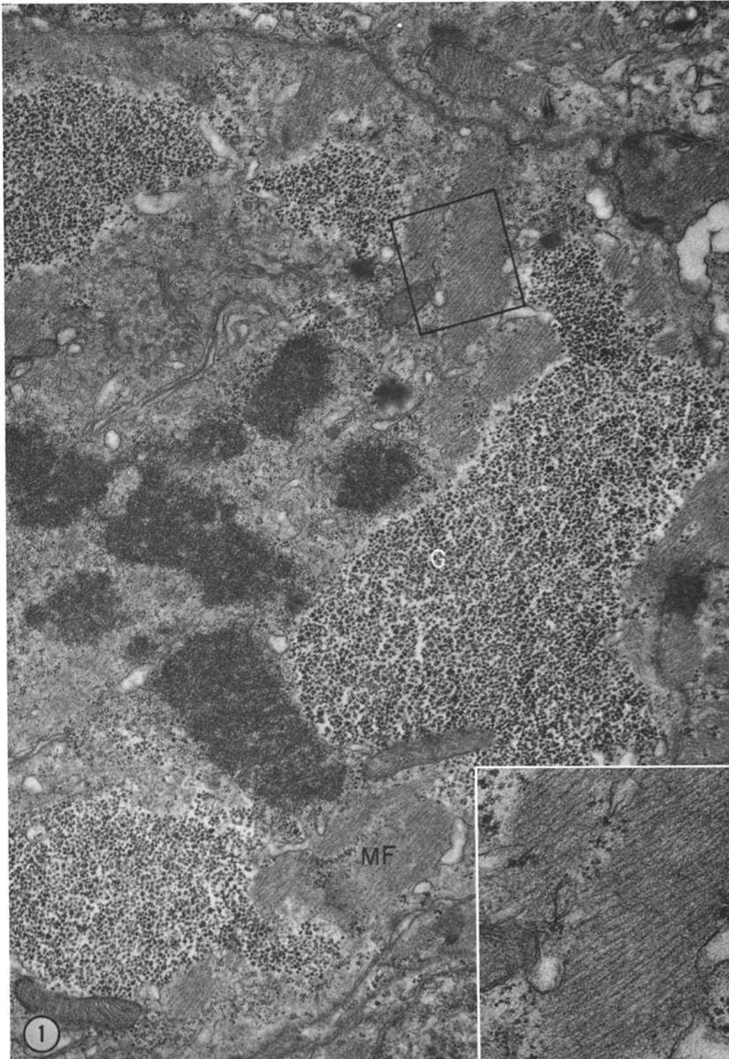
FIGURE 1 This dividing cell from the ventricle of an 11-day-old chick embryo exhibits a normal state of differentiation. Large accumulations of glycogen ( G ) are present and the cytoplasm contains numerous myofibrils ( MF ) which are cut tangentially. A desmosome and a developing intercalated disc are present. Chromosomes are prominent, and the cell has retained its Golgi complex. Inset : Higher magnification of the tangentially cut myofibrils demonstrating thick and thin filaments.