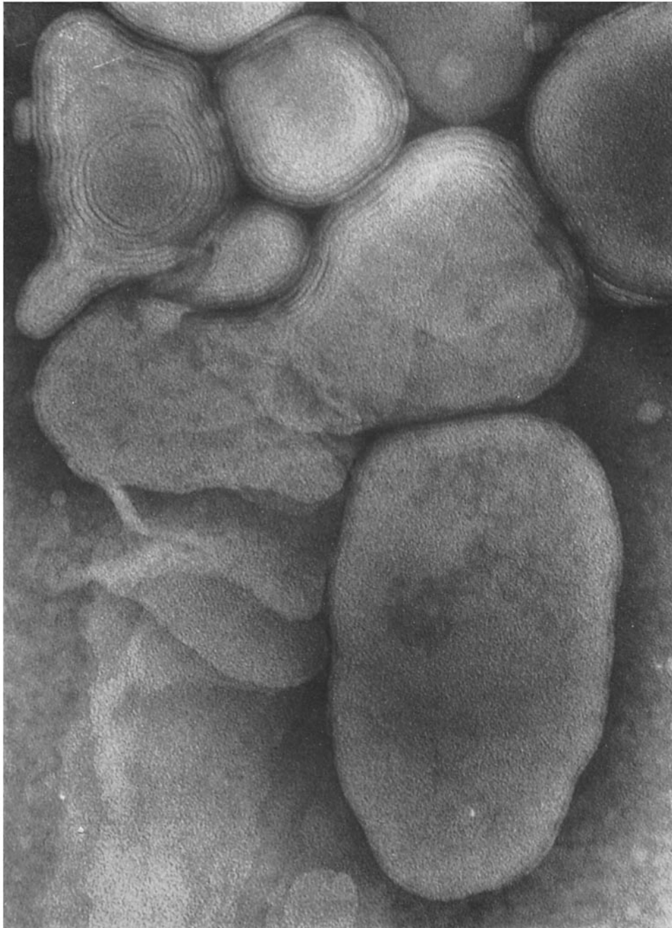
FIGURE 3 Negative staining of the floccules by the salts employed in the tricomplex reaction. Magnification, 280,000.