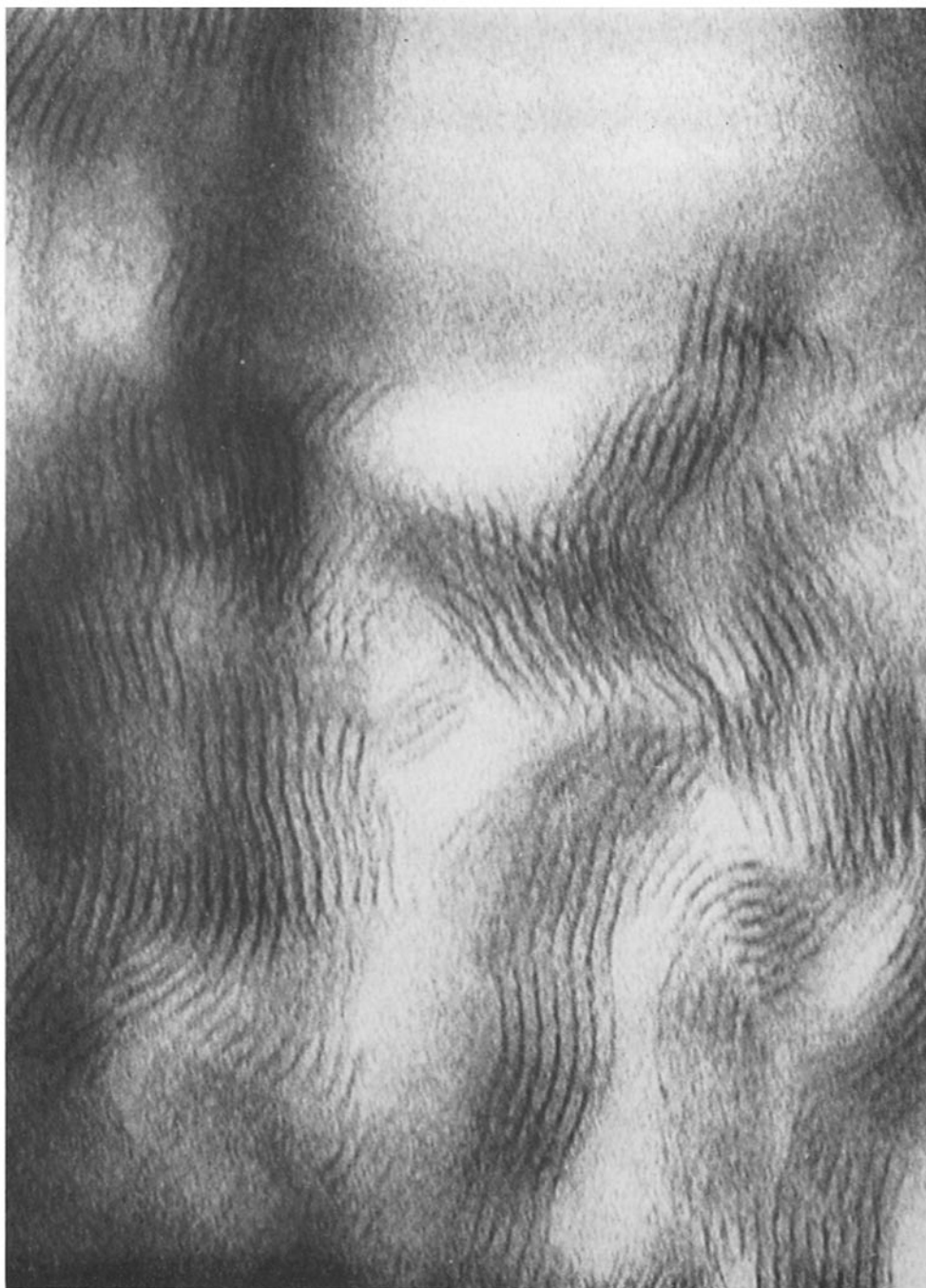
FIGURE 4 L - \alpha -(ditetradecanoyl)lecithin fixed by the tricomplex method with cobalt nitrate and ammonium molybdate. The width of the dark bands, the polar layers, depends upon their orientation with respect to the electron beam. Magnification, 540,000.