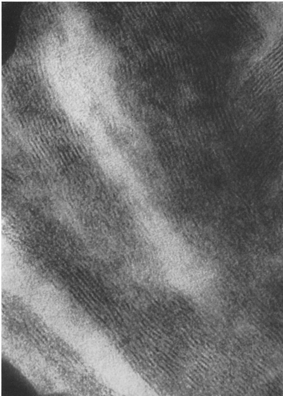
FIGURE 2 Brain phospholipids fixed by the tricomplex method with cobalt nitrate and ammonium molybdate. Magnification, 450,000.