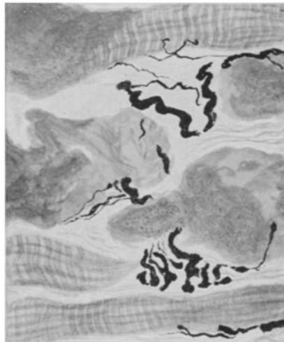
FIG. 1 b