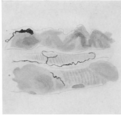
FIG. 1 a