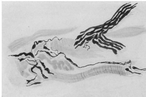
FIG. 1 c

(Rogers et al. : Nerve endings in muscular dystrophy)