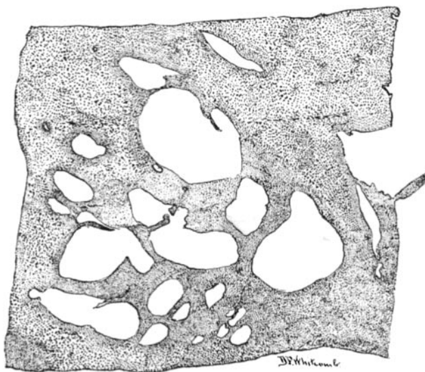
FIG. A.—Gas cysts in the brain.

The veins and capillaries of the pia-arachnoid over the pons, medulla and spinal cord contained great numbers of polymorphic bacilli. In the spinal meninges the vessels were dilated and crowded with bacilli. Some of the vessels were widely distended with gas and a varying number of bacilli were seen near the intima. In some places bacilli were found free in the tissues of the pia-arachnoid.