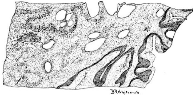
FIG. B.—Gas cysts in the cerebellum.

In the internal capsules, lenticular nuclei, and cerebellum many of the veins and capillaries and some of the small arteries were crowded with small polymorphic bacilli. Some of the vessels of the cortex cerebri and of the pons and medulla contained bacilli. The spinal cord was free from gas cysts and its blood-vessels contained no bacilli. No degenerative changes were made out in the brain, pons, medulla, or cord. The ganglion cells were well preserved and stained well.