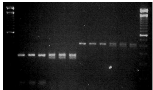
Figure 1. Detection of wild-type, Asp299Gly, and Thr399Ile alleles in the human TLR4 gene. Genomic DNA of individuals recruited into the current study was amplified according to the method of Lorenz et al. (reference 4). PCR products were digested with the enzymes NcoI (299 allele) or HinfI (399 allele). Lanes 1 and 14, 100 base pair marker. Lanes 2-7, RFLP of the 299 section of TLR4 gene from three wild-type donors and three heterozygotes. Lanes 8-13, RFLP of the 399 section of TLR4 gene from three wild-type donors and three heterozygotes. Top band represents presence of wild-type allele, bottom band indicates presence of mutant allele. Genotypes were confirmed by sequencing.

There are several possible explanations for the discrepancy between the findings of these workers and the current study. First, airway responses to LPS are known to be highly variable between healthy donors (13). Arbour and colleagues categorized study subjects challenged with inhaled endotoxin as 'LPS responsive' if their forced expira-