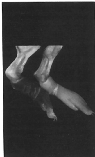
Figure 1. Borrelia burgdorferi -induced proximal arthritis in inbred mice. Right tibiotarsal joints were examined 3 wk after right footpad infection to correlate gross pathological changes with pre-mortem finding of increased ankle diameter in C3H/HeJ (left) compared with BALB/c (right) mice. Periarticular swelling (posterior) with synovial and tendon fibrosis (anterior) in C3H/HeJ mice is similar to that described following distant inoculation of the spirochete (2, 3, 10).

24) compared with BALB/c mice (mean diameter 2.94 mm, SEM 0.04, n = 18 ) and correlated with greater periarticular inflammation and synovial and tendon fibrosis on gross examination of dissected ankles from killed animals (Fig. 1). Left ankle arthritis began to develop after the third or fourth week but was generally absent in BALB/c mice and less severe in C3H/HeJ mice than their own right ankle disease (data not shown).