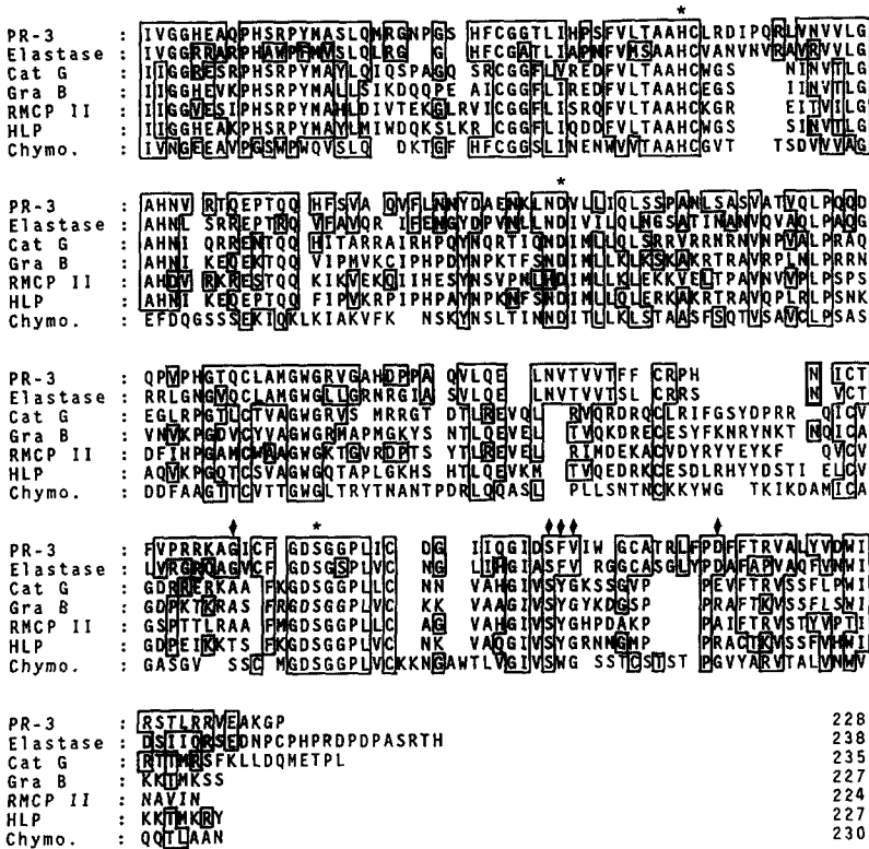
Figure 3. Alignment of the predicted p29b (PR-3) sequence with other serine proteases. Gaps were introduced to maximize alignment. Conserved residues are boxed. The His, Asp, Ser residues comprising the catalytic sites are indicated by asterisks. Residues lining the substrate binding pocket of serine proteases (36) are marked by diamonds. The human elastase sequence is from reference 28, human cathepsin G (Cat G) from reference 29, mouse granzyme B (Gra B) from reference 43, rat mast cell protease II (RMCP II) from reference 30, human lymphocyte protease (HLP) from reference 44, and bovine chymotrypsin A (Chymo.) from reference 45.

specificity of the substrate-binding pocket in serine proteases (36). In all these positions (Gly 170 , Ser 191 , Phe 192 , Val 193 , Asp 204 ; marked by filled diamonds in Fig. 3), p29b matches elastase, but in four of the five cases there is no match to the other proteases listed. This suggests that the substrate specificity of p29b is very similar to that of elastase.