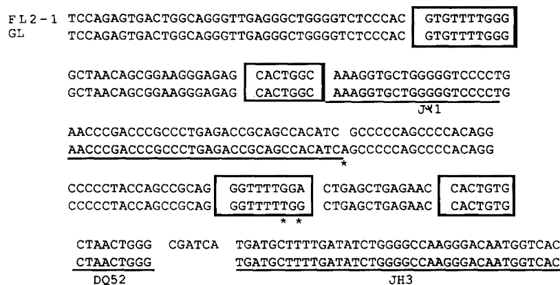
FIGURE 2. Nucleotide sequence of FL2-1 compared with germline sequences of J H 3, DQ52, and 5' flanking regions including Jψ1; differences between the two sequences are starred; recognition heptamer and nonamer sequences are enclosed in boxes. These sequence data have been submitted to the EMBL/GenBank Data Libraries under the accession number Y00798.

V H -associated Rearrangements. Although most rearrangements in these cell lines were identifiable as DQ52-J H joins, several were candidates to be rearrangements using other D or V H segments. By molecular cloning we identified three V H -associated rearrangements from these cell lines (Figs. 3 and 4). Two of them used members of the largest human V H family, V H 3 (14). One of these, FL2-2 , was isolated from a genomic Hind III library of FL2A. The cloned fragment was not evident on Southern blots because it comigrated with the rearrangement identified as a DQ52-J H 4. It was clearly distinct, however, because on Southern blots of cloned DNA, it did not hybridize with probe B (not shown). The V H 3 gene used by FL2-2 differs by only 1 bp from that of a germline V H 3 gene previously isolated (V H 1.9III,14). The D