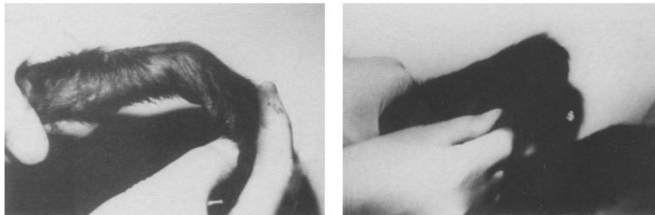
FIGURE 3. Photograph of the wrist of a monkey immunized 3 mo previously with type II collagen showing restricted flexion ( left ) the wrist of a control monkey ( right ) is shown for comparison.

Immune Response to Collagen. All of the monkeys immunized with type II collagen developed high levels of circulating antibody specific for the immunizing antigen