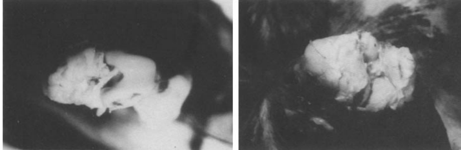
FIGURE 4. Cartilage surface of knee joints from type II collagen immunized ( right ) and control animal ( left ) at autopsy. The control joint has a smooth cartilage surface in contrast to the rough and eroded cartilage surface of the arthritis joint.

(Table I). When antibody levels to fragments of collagen were measured, there was substantial heterogeneity in the response (Table I). However, all monkeys responded strongly to cyanogen bromide peptide 11, which has previously been shown to contain an epitope arthritogenic for DBA/1 mice (6). This was in fact the only peptide with which all immune sera reacted strongly.