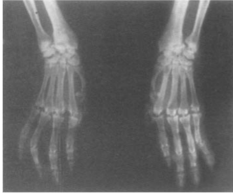
FIGURE 2. Radiograph of the wrists and hands of a monkey 3 mo after immunization with type II collagen. There is soft tissue swelling and marked destructive changes in both wrists. Several metacarpophalangeal and interphalangeal joints are narrowed with erosions.

refused to bear weight on their legs and sat in the back corner of their cages. This resulted in contracture of the flexor tendons of the legs which did not resolve.