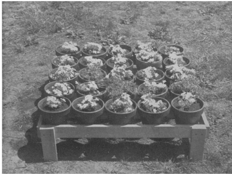
FIG. 1. Arrangement of 25 flower pots planted with Phlox sabulata alba . Any one of the pots can be put on a turntable and rotated. By the increase in flicker produced by the rotation more bees are attracted to the moving flowers.

By studying the bee's reaction to natural and artificial flower beds which can be moved, evidence can be brought about for the effect of flicker upon the bee's reaction toward the experimental arrangement.