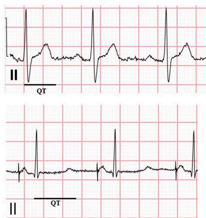
EKGs from individuals with (bottom) or without (top) LQTS. Both are lead II.

The most common of these mutations involves KCNQ1 , KCNH2 (encoding the hERG K^+ channel), and SCN5A (encoding the Na_v1.5 Na^+ channel). Terrenoire et al. (2013) used iPSCs differentiated into cardiomyocytes (iPSC-CMs) to investigate the physiological basis for arrhythmias in a child with LQTS bearing a de novo mutation in SCN5A (F14773C) and a common polymorphism in KCNH2 .