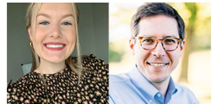
Insights from Abigail R. Gress and Tyler D. Bold.

A previous publication from the same group found that CD153, the ligand for CD30, is highly expressed by a protective CD4 T cell population in the lung parenchyma of Mtb-infected mice and is required for CD4 T cell-mediated protection in the mouse model of TB (Sallin et al., 2018). The authors further investigated