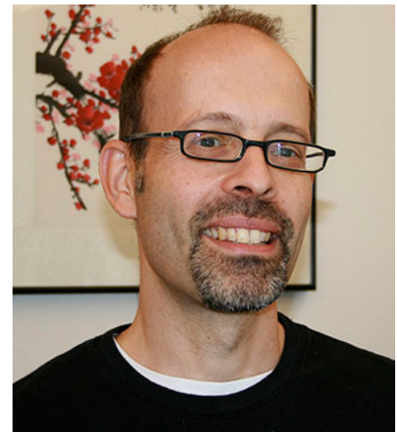
Insights from Michael S. Diamond.

The 40-nucleotide deletion was predicted to impair the splicing of the last exon and affect the Ig-like domain and the C-terminal part of IL-18BP. Through a series of genetic and biochemical experiments, Belkaya et al. (2019) show that the mutation in IL18BP disrupted gene splicing and resulted in more rapid degradation of mRNA transcripts and a loss of or abnormal expression of the IL-18BP protein. Subsequently, they evaluated