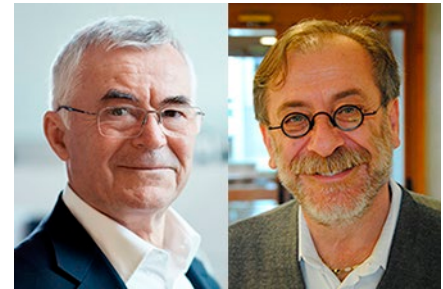
Insights from Rino Rappuoli and Giuseppe Del Giudice.

poorly performing vaccines with important health and economic consequences. Universal influenza vaccines aim to protect against several, if not all, influenza infections (Erbelding et al., 2018). In 1993, a first study described a broadly neutralizing monoclonal antibody specific for an epitope in the conserved region of the HA stalk which was also able to block virus-mediated cell-cell fusion (Okuno et al., 1993). This initial observation was confirmed 15 yr later by the isolation of many monoclonal antibodies cloned from human memory B cells that recognized conserved epitopes in the HA stalk (Corti et al., 2011; Ekiert et al., 2011; Dreyfus et al., 2012). So far, the available vaccine technologies have been used to induce stalk-specific antibodies and increase their poor immunogenicity with the scope to develop a universal influenza vaccine (Krammer et al., 2013; Impagliazzo et al., 2015; Yassine et al., 2015;