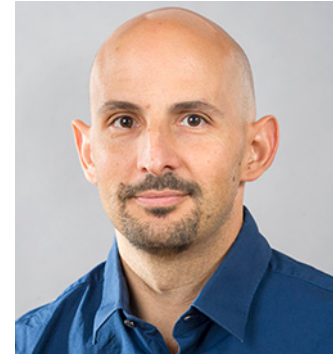
Insight from Gustavo J. Martinez

Mink1 deficiency results not only in a T cell-intrinsic enhanced Th17 cell commitment, but also in an increase in activated/memory phenotype. By using mixed bone marrow chimeras in Rag1 -/- mice, Fu et al. (2017) showed that compared with WT counterparts in the same recipient mice, Mink1-deficient cells displayed enhanced IL-17 production and expression of the activation marker CD44 and reduced expression of the lymph node homing receptor CD62L, which is highly expressed in naive cells. The exact mechanism leading to this increased activated status by T cells lacking Mink1 expression was not addressed by Fu et al. (2017). Further research to delineate how Mink1 prevents