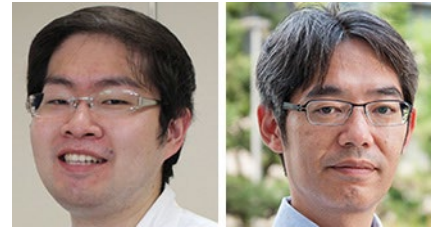
Insight from Takashi Mino and Osamu Takeuchi

To identify methyltransferases mediating the K366-monomethylation of IRF3, the Wang et al. (2017) performed coimmunoprecipitation and mass spectrometry analysis. They found that a lysine methyltransferase, NSD3, directly binds to IRF3. The K366 methylation of IRF3 was inhibited by VSV infection in infected NSD3-deficient macrophages. Moreover, an in vitro methylation assay