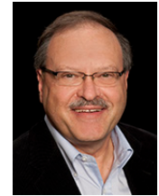
Insight from Arthur Weiss

Human immune deficiencies often reveal unexpected functions or highlight differences between human and mouse immune systems. In this issue, Keller et al. describe a family with three children that are homozygous for LAT mutations leading to premature LAT truncation, eliminating all of its known tyrosine phosphorylation sites.