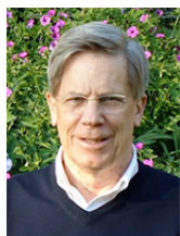
Insight from Douglas Fearon

In this issue, Chapuis et al. describe the response of a single patient with metastatic melanoma to combination immunotherapy with anti-CTLA4 and adoptive T cell therapy (1). Although JEM usually discourages the submission of single case studies, the editors, like the authors, realized that this patient was unusual. He had previously been treated with anti-CTLA4 and adoptive T cell therapy administered as monotherapies, with only possible slowing of tumor growth with the former, and no response to the latter. The subsequent complete and durable clinical response to simultaneous treatment with these two modalities, therefore, allowed an argument to be made that their combination was responsible for the improved outcome.