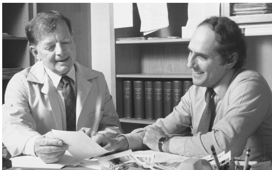
Zanvil A. Cohn (left) and Ralph M. Steinman (right).