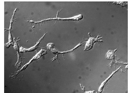
Cells elongate but are unable to detach their tails when the MyH9 myosin is blocked.

Even without the myosin, the uropod integrins were already in an inactive form, as shown by their failure to bind antibodies specific for active integrins. Clusters of these inactive integrins, however, still formed weak bonds with their ligands. The positioning of the myosin near these weak attachments