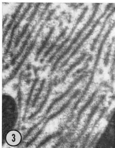
FIGURE 3 Rat liver parenchymal cell. The cisternae of the endoplasmic reticulum stain densely, and the membranes stand out in "negative" contrast. \times 35,000 .

The stoichiometric relationship between the PTA stain and a protein varies with the amino acid