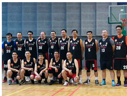
Hongyuan's "metabolism team" after a basketball game.