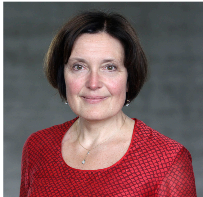
Suzanne Eaton.

In subsequent work, they extended their analysis to demonstrate that shortly after prepupal stages forces, caused by contraction of the wing hinge region, exert long-range influences on the wing proper by inducing elongation of cells and thus narrowing of the wing tissue, mediated by cell shape changes, cell rearrangements, and cell divisions. Thereby,