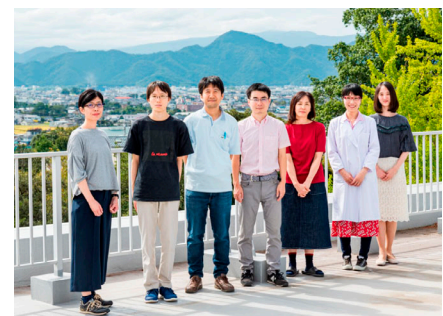
Maeshima laboratory members at the rooftop of NIG with a view of the Izu mountains.