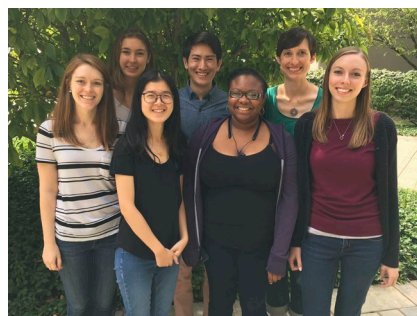
The Lackner Lab in September 2017.

When I take a student into my laboratory, I am making a commitment that I will be the mentor they need during the course of their graduate career. My success or failure as a mentor will influence their future and career path. That is a responsibility I have not had previously, has taken some time to adjust to, and sometimes keeps me awake at night as it is one I take very seriously.