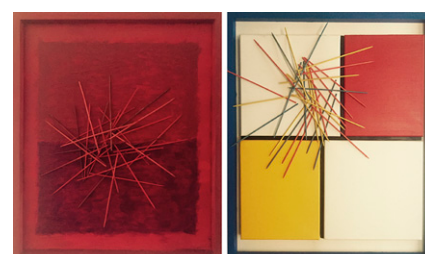
Conceptual paintings. Mikado on Rothko (left) and on Mondrian (right).