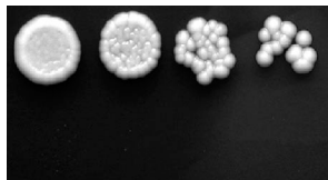
Yeast cells lacking the replication and spindle assembly checkpoints are able to form colonies (top row) unless S phase is delayed (bottom row).

Cells need to copy their DNA before they can separate their chromosomes. The DNA replication checkpoint monitors the progress of the first step, and the spindle assembly checkpoint (SAC) regulates the second. Still uncertain is how cells dovetail the end of replication with the beginning of mitosis. If researchers disrupt DNA synthesis, the replication checkpoint kicks in and halts the cell cycle. Whether the checkpoint forestalls mitosis under normal circumstances remains unclear, however.