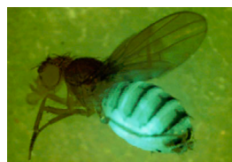
GFP-labeled cells lacking Bub3 and expressing the apoptosis inhibitor p35 quickly fill the abdomen of an adult fly.

M orais da Silva et al. show that the checkpoint protein Bub3 suppresses tumorigenesis independently of its role in chromosome segregation.