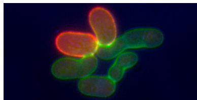
Yeast buds lacking Zds1 and Zds2 (green) are abnormally elongated because they delay mitosis.

helps determine when cells begin and end mitosis. Two other proteins, Zds1 and Zds2, keep the complex under control. They switch on PP2A to nudge the cell into mitosis and switch it off to spur the cell to exit mitosis. Rossio and Yoshida wanted to investigate how this regulation occurs.