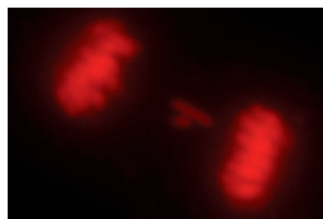
A single chromosome lags behind the others in a dividing cell overexpressing UbcH10.

A ubiquitin-conjugating enzyme that regulates the cell cycle promotes chromosome missegregation and tumor formation, say van Ree et al.